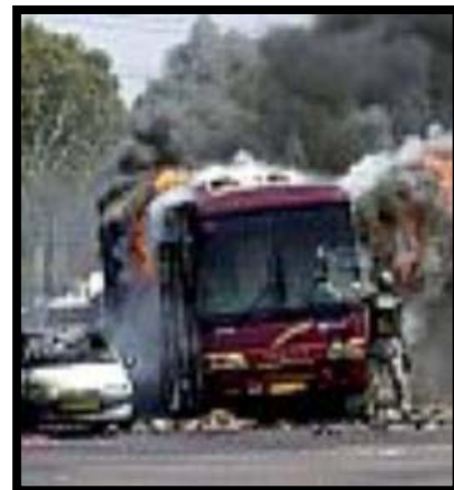
Example of hand-held IED and the damage from hand held IED