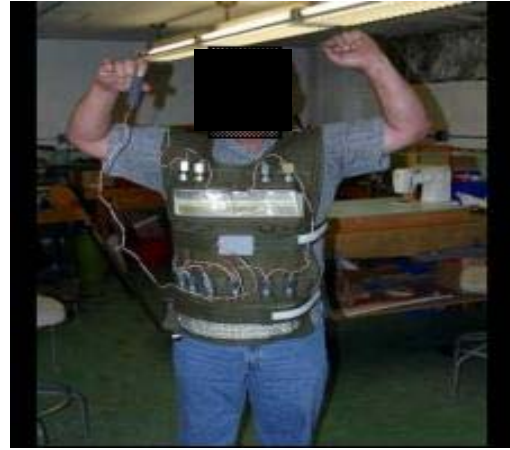
Examples of both a briefcase and vest used to contain or carry an IED