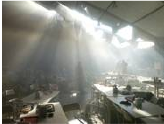
Mosul Mess Tent